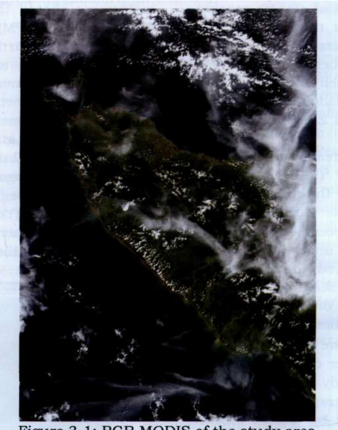
Figure 3-1: RGB MODIS of the study area