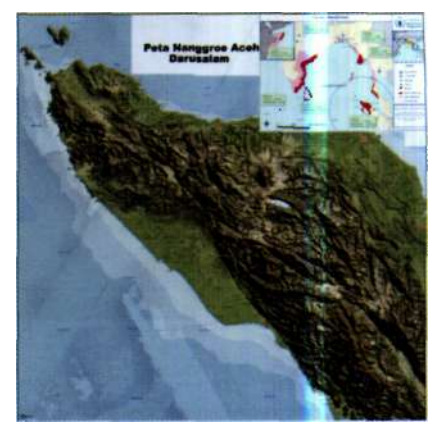
Figure 2-1:The study area of NAD province, Indonesia

free download from MODIS Rapid Response Project appropriately: "Image courtesy of MODIS Rapid Response Project at NASA/GSFC" captured on 29th December 2004. MODIS data with the sensor on board the Terra satellite are one of the most used for environmental studies. MODIS (or Moderate Resolution Imaging Spectroradiometer) is a key instrument aboard the Terra (EOS AM) and Aqua (EOS PM) satellites. Terra's orbit around the Earth is timed so that it passes from north to south across the equator in the morning, while Aqua passes south to north over the equator in the afternoon. Terra MODIS and Aqua MODIS are viewing the entire Earth's surface every 1 to 2 days, acquiring data in 36 spectral bands, or groups of wavelengths. These data will improve our understanding of global dynamics and processes occurring on the land, in the oceans, and in the lower atmosphere.