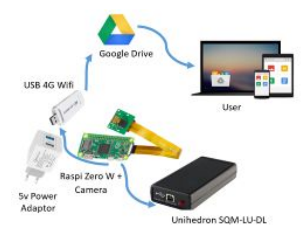
Figure 1. Flow chart of the true dawn observation system.

phases. In the next step, the selected data are analyzed by the gradient method per minute to determine the turning point of the curve which is an indication of true dawn obtained from the data with the formula: