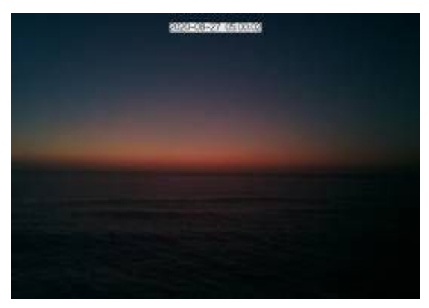
Figure 3. One of the true dawn images recorded.