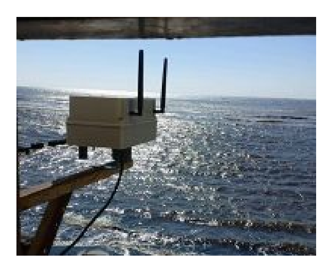
Figure 2. System installation at Banyuwangi.

The first step in testing the system started with the assembly of the system hardware as shown in Figure 1 and position-